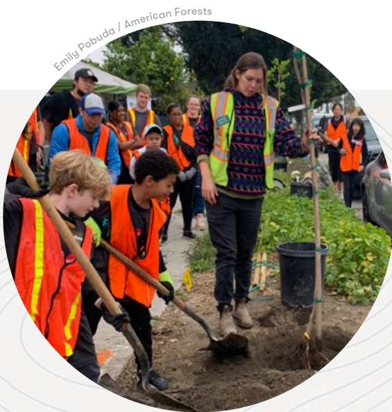
Mattel and American Forests planting event supported by Tree People the local planting partner in Watts, Los Angeles, CA

Key priorities (selected from your Coalition Roadmap Worksheet – Activity 2.5 )